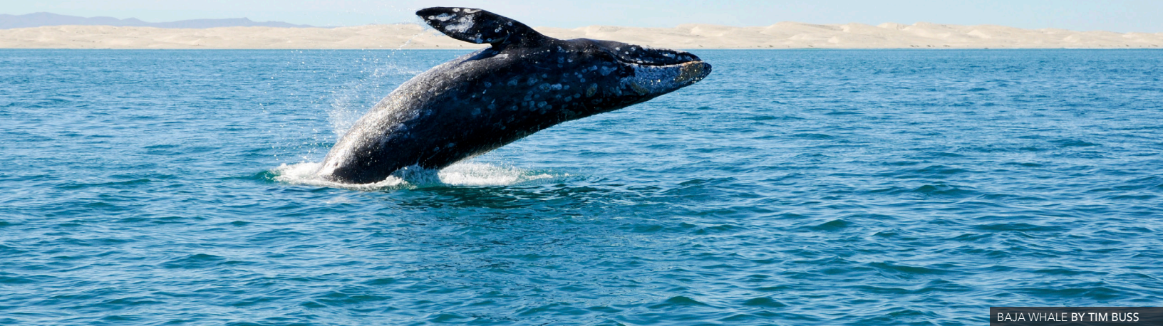
BAJA WHALE BY TIM BUSS